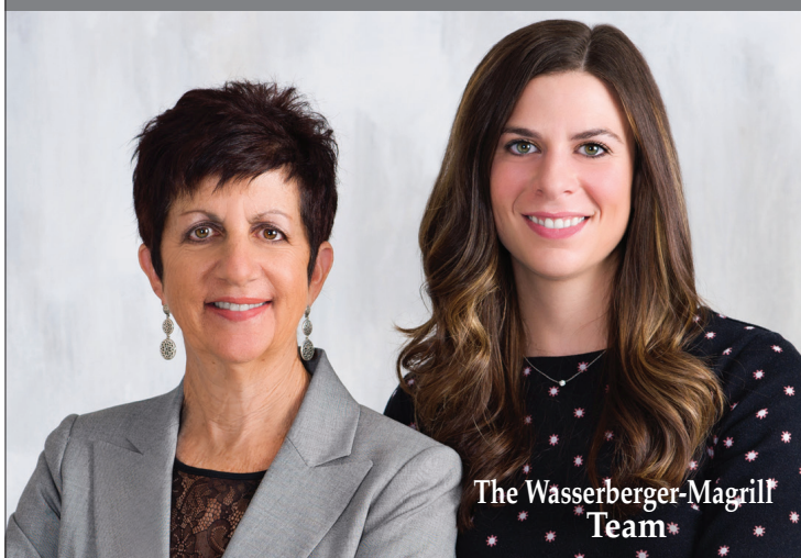
The Wasserberger-Magrill Team